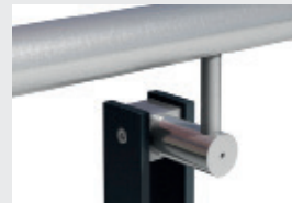
· BB5 - Offset Handrail (single or double) with barrel bracket