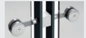
· L4 - Banjo lug