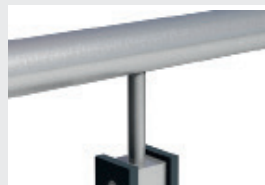
· BB6 - Inline Handrail