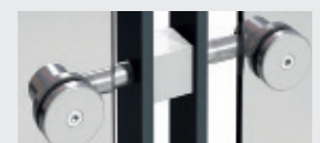
· L6 - Inline Barrel Lug