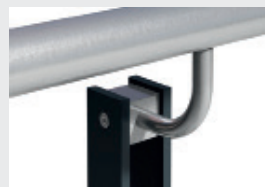
· BB3 - Offset Handrail (single or double) with radius bracket