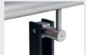
· BB5 - Offset Handrail (single or double) with barrel bracket