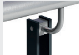
· BB3 - Offset Handrail (single or double) with radius bracket