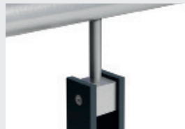
· BB6 - Inline Handrail