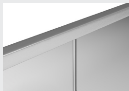
• Small Top Capping