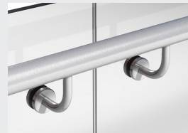
• BB3 - Offset Radius Bracket (single or double)