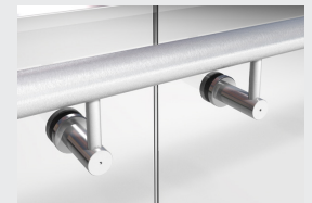
• BB5 - Offset Barrel Bracket (single or double)